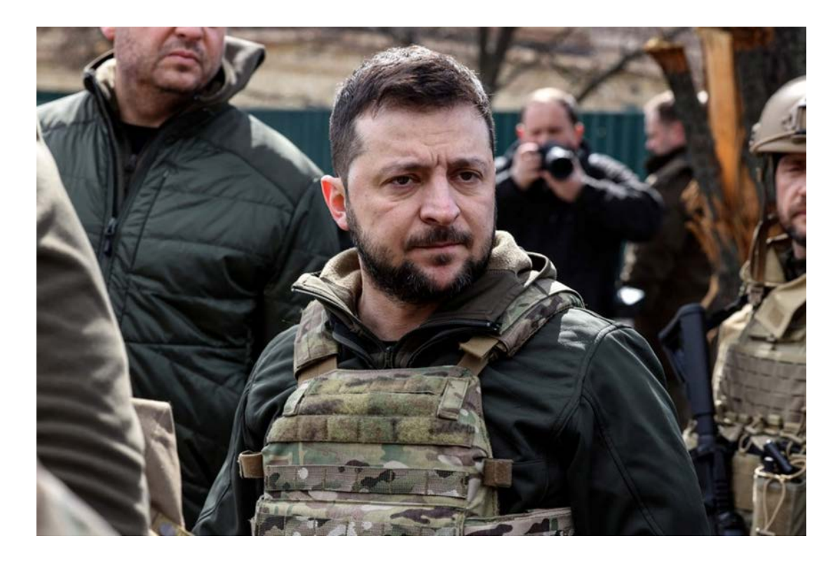
Fig. 5: Ukrainian President Zelensky in Bucha on April 4, 2022

that it would have been a realistic task to cut the only one existing north-south road. After the accession of the two central Nordic states, Russia can forget about this. NATO member Finland with its 1,340 km-long border with Russia would even provide the strategic depth for an eventual advance towards Murmansk, the naval bases of the Northern Fleet at the Barents Sea and possibly also at the White Sea, which are together also home to more than half of Russia's ballistic missile submarines.<sup>78</sup> If Murmansk and the Kola Peninsula would be lost, Russian efforts in the North Atlantic could not be sustained and Russian strategic deterrence would suffer a heavy blow. Consequently, Russia would need to plan for the -costly- deployment of a very significant number of troops to protect this flank, troops they will not be able to use elsewhere.