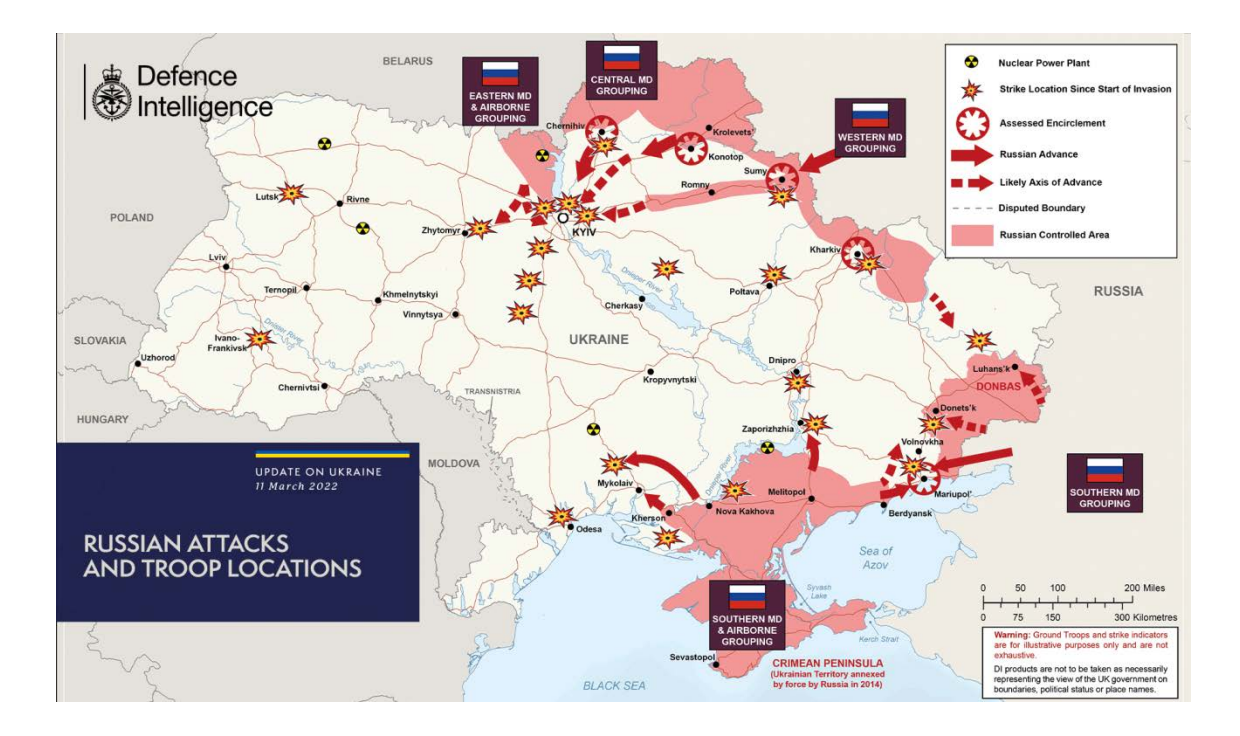
Fig. 8: Military situation in Ukraine on March 11, 2022, before the Russian Army retreated from Kyiv and the northern and northeastern front (UK Ministry of Defence 2022)

and ballistic missiles, are dependent upon specialized components manufactured by Western countries that cannot be replaced by indigenous production and that are now included in sanctions.<sup>115</sup>