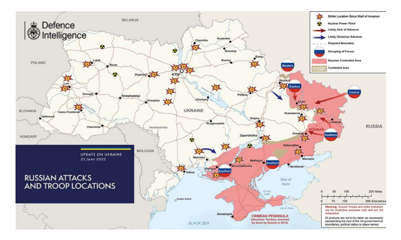
Fig. 1: Situation in Ukraine on June 23, 2022 (UK, Ministry of Defense)

Putin equated the invasion in Ukraine with the historical struggle of WWII and promoted the argument that NATO was planning an invasion in Crimea using Ukraine as a proxy actor: "NATO countries did not want to listen to us. They had different plans, and we saw it. They were planning an invasion into our historic lands, including Crimea. [...] Russia gave a preemptive rebuff to aggression; it was a forced, timely, and only right decision".<sup>18</sup>