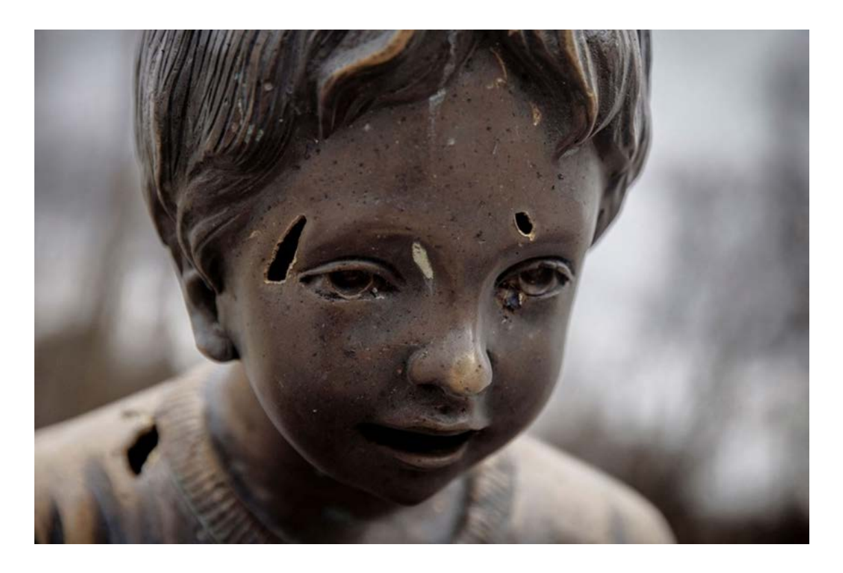
Fig. 10: Shrapnel marks on the statue of a child after shelling hit Gorky Park, an amusement park in Kharkiv, on April 2, 2022

Ukrainian forces to sustain the war against Russia. Crucial assistance includes not only logistics and weapon deliveries (including deadly Stinger surface-to-air missiles and Javelin anti-tank guided missiles), but also extensive intelligence support. Ultimately, comprehensive sanctions shall force Russia to end the war or -as a fallback option- to make a "success" extremely costly to deter further aggression by Russia (or other countries from following the Russian example). The strategic objective is to enforce a withdrawal of Russia from Ukraine or at least to prevent a further expansion of the Russian influence beyond what they have achieved right now by making the war in Ukraine as costly as possible for them.