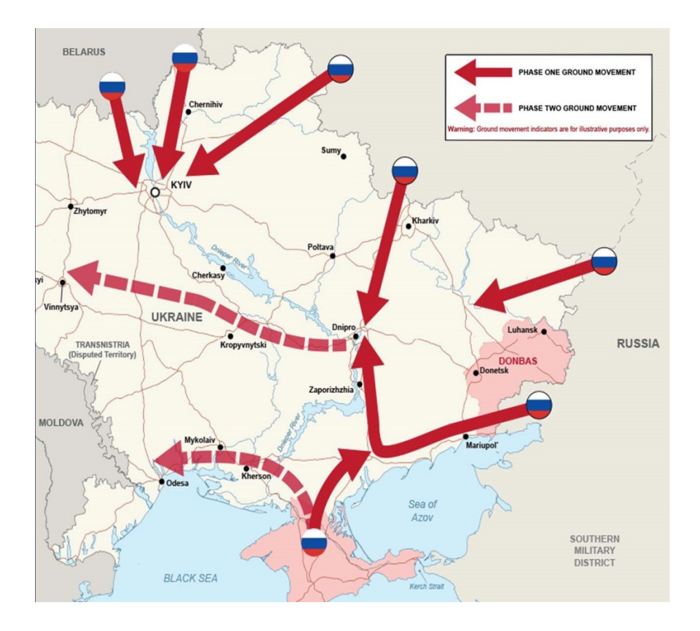
Fig. 7: Possible axes of Russian invasion according to British intelligence before the invasion (UK Ministry of Defence, 17 February 2022)

Russian planners largely neglected the need for a 3:1 superiority at least on a local level by attacking forces over a defender during the opening phase of the war. Ignoring this basic military rule of thumb without being able to make up for the lack of troops by firepower was a key factor in leading to disaster.