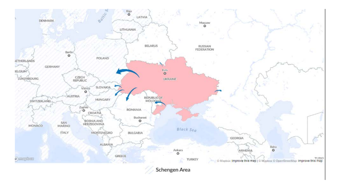
Fig. 2: Ukrainian refugees in neighboring countries (United Nations, Ukraine Refugee Situation)

The Russian invasion has caused a major humanitarian crisis with multiple civilian casualties and effectively the largest wave of refugees since WWII with 8 million Ukrainian refugees fleeing the territory of Ukraine until late June and millions more internally displaced.<sup>21</sup>