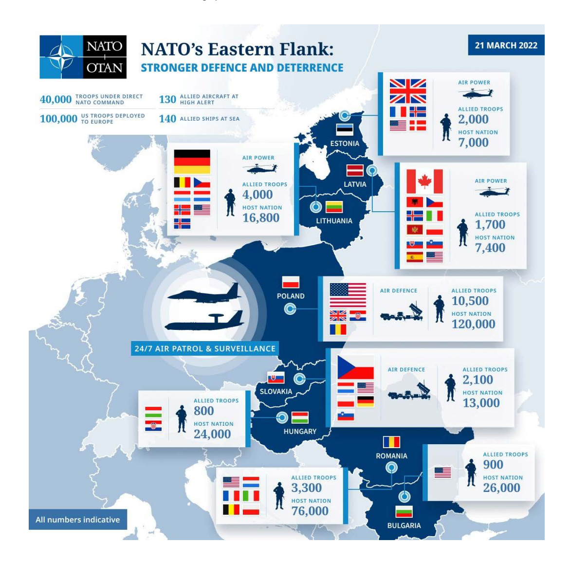
Fig. 4: Reinforcement of NATO's Eastern flank after the Russian invasion (NATO 2022)

establishing a buffer zone between Russia and NATO. Putin considered this buffer zone with the ongoing process of rapprochement to NATO and EU as threatened or even gone. Ukrainian former President Viktor Yanukovych, who was after massive street protests ("Revolution of Dignity") removed from office by the Parliament in February 2014, is a native of Donetsk, the largest city of the Donbas. He might be Putin's man of choice for a future Russia-friendly president.<sup>73</sup>